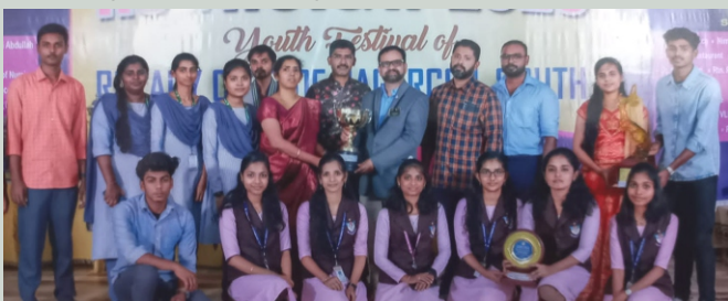
Youth Welfare and Fine Arts Club emerged as the overall champions of 'Rotaryutsav 2023' organized by Rotary Club of Nagercoil.