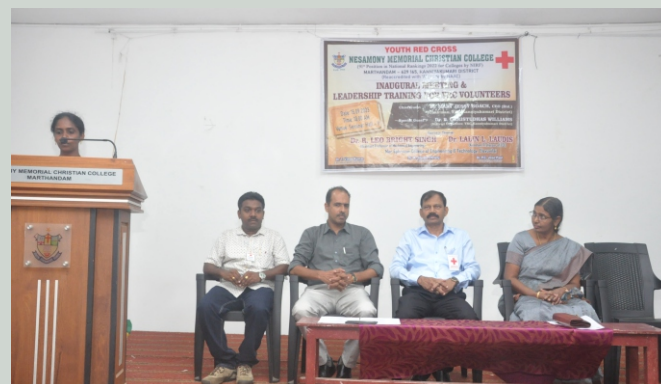
YRC Inaugural Meeting and Leadership Training for YRC Volunteers was held on 15-09-2023