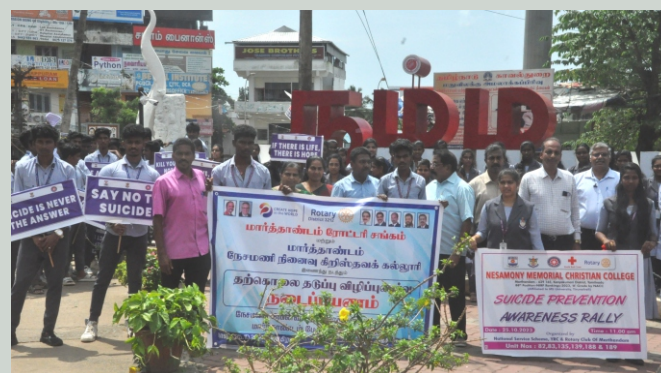
A Suicide prevention awareness rally was conducted by NSS and YRC of our college in association with Rotary Club of Marthandam on 25-10-2023.