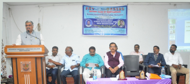
Rotary Club of Marthandam in association with NMCC in commemoration of World Mental Health Day, conducted a Programme "Awareness about Stress Management and Drug De-Addiction" on 13-10-2023.