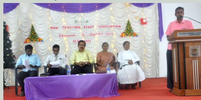
Christmas Family Get-together for Non-Teaching Staff was held on 22-12-2023.