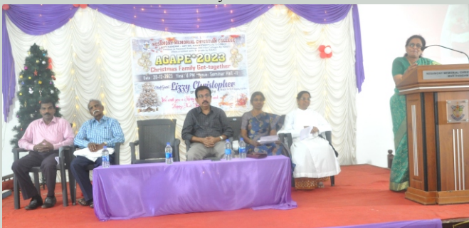
Christmas Family Get-together for Teaching Staff was held on 20-12-2023.