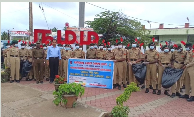
"Garbage Free India Swachhata Hi Sewa (SHS) campaign - 2023 was conducted at Marthandam Bus stand by our NCC cadets on 04-10-2023.