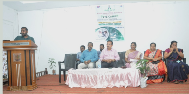
Digit Eyes and NSS jointly organised an Eye Camp on 21-07-2023.